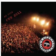
Ao vivo no Festival de Músicas do Mundo (2011)