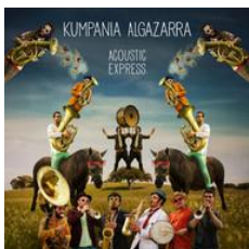
Acoustic Express (2015)