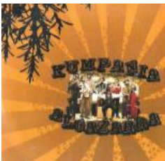
Kumpania Algazarra (EP 2005)