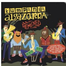
Kumpania Algazarra Remixed (2010)